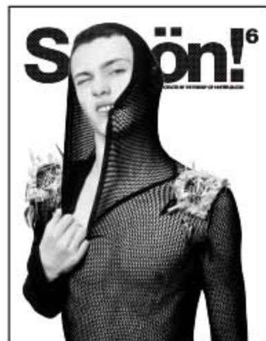
Styling / Charles Adesanya Model / Callum Wilson @ Select